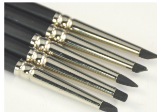
Rubber-tipped sculpting tools ACW #F-251