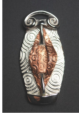
Art Clay Copper and Silver Pendant by Carol Babineau