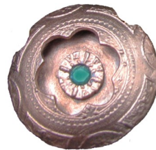
Shadowbox Pendant by Katie Baum—Torch Fired!

NOTE: If a hot, fired piece is left to cool in the kiln or open air after firing, the oxidized layer will be thicker and small bits may fly into the air. If you have fired a piece and will not be quenching it, cover it immediately after firing with fiber blanket until cool.