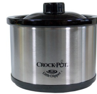
Convenient mini-crock pot for heating pickling solution ACW #F-222.

Note: Thoroughly clean your tumbler and tumbling media before and after polishing the copper, or use a separate set of brushing/burnishing tools so as not to contaminate any subsequent artwork of any other metal.