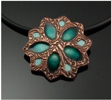
Enameled Art Clay Copper Pendant by Pam East