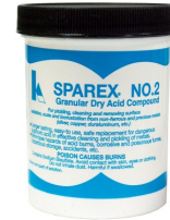
Pickling agent for removing firescale from fired copper. ACW #F-039

Please be environmentally responsible and follow the instructions included with the product for proper use and disposal of pickling solution.